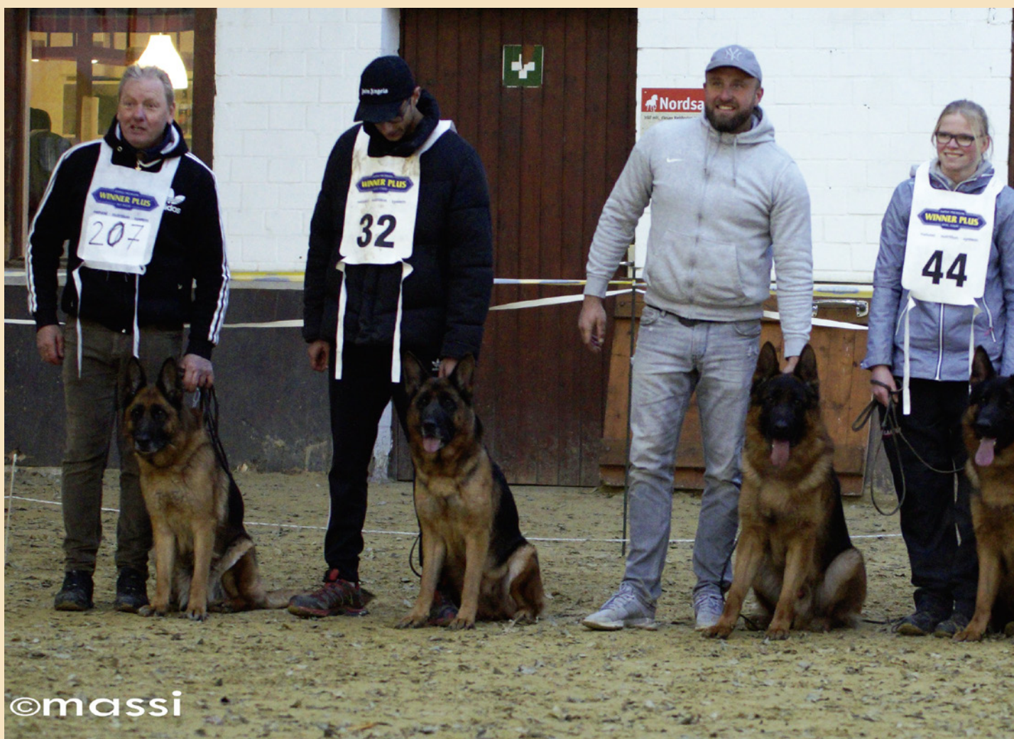
FAMILY TIES The maternal family of “Ibizi von Arlett” at the OG Naturpark Dümmer breed show.